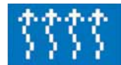
Low Air Loss