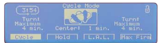
Interactive Set up function